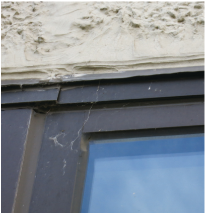
ONE SOLUTION FOR 3 FAILED JOINTS