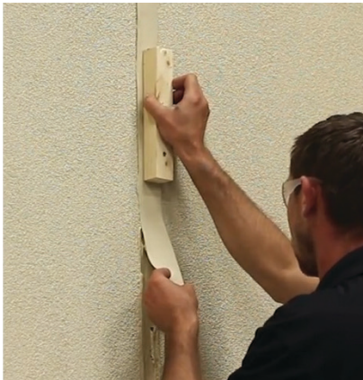
FIRST TIME INSTALLER