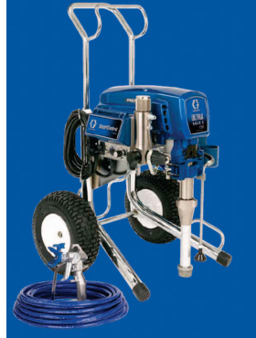
Ultra Max II 1595

Unit Includes: New Contractor Gun, 50' hose, Whip, Tip & Housing