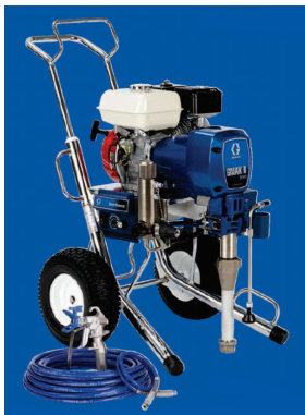
GMAX II 5900

Unit Includes: New Contractor Gun, 50' hose, Whip, Tip & Housing