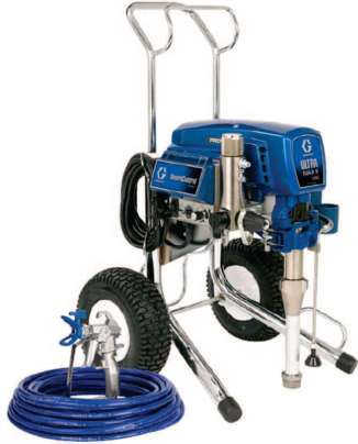
Ultra Max II 1095

Unit Includes: New Contractor Gun, 50' hose, Whip, Tip & Housing