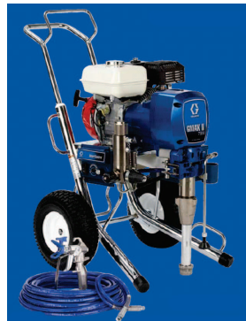
GMAX II 7900

Unit Includes: New Contractor Gun, 50' hose, Whip, Tip & Housing